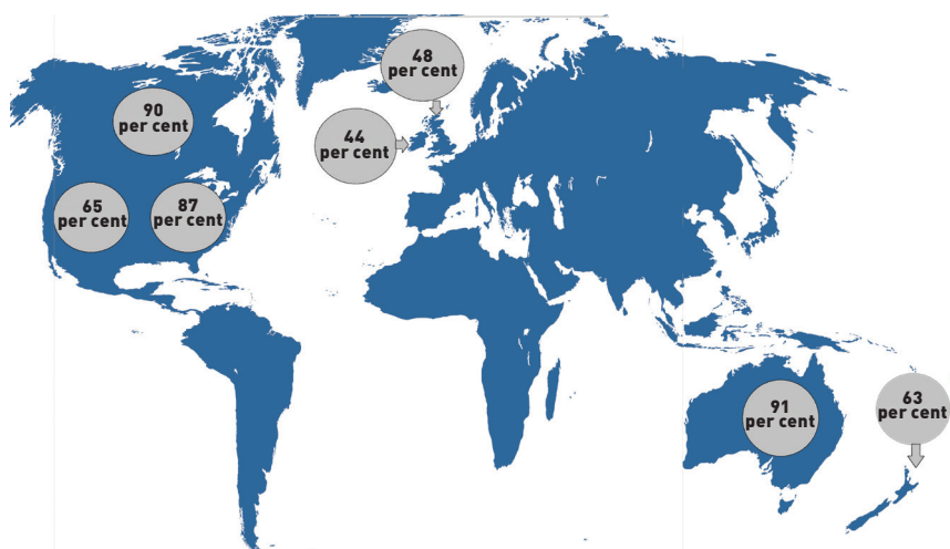
Fig 1: Percentage of veterinarians who have reported seeing cases of non-accidental injury in practice: 65 per cent – Indiana, USA (Sharpe 1999); 90 per cent – Canada (Kovacs and others 2004); 87 per cent – Colorado, USA (Humane 2003); 44 per cent – Ireland (McGuinness and others 2005); 48 per cent – UK (Munro and Thrusfield 2001a); 91 per cent – Australia (Green and Gullone 2005); and 63 per cent – New Zealand (Williams and others 2008)